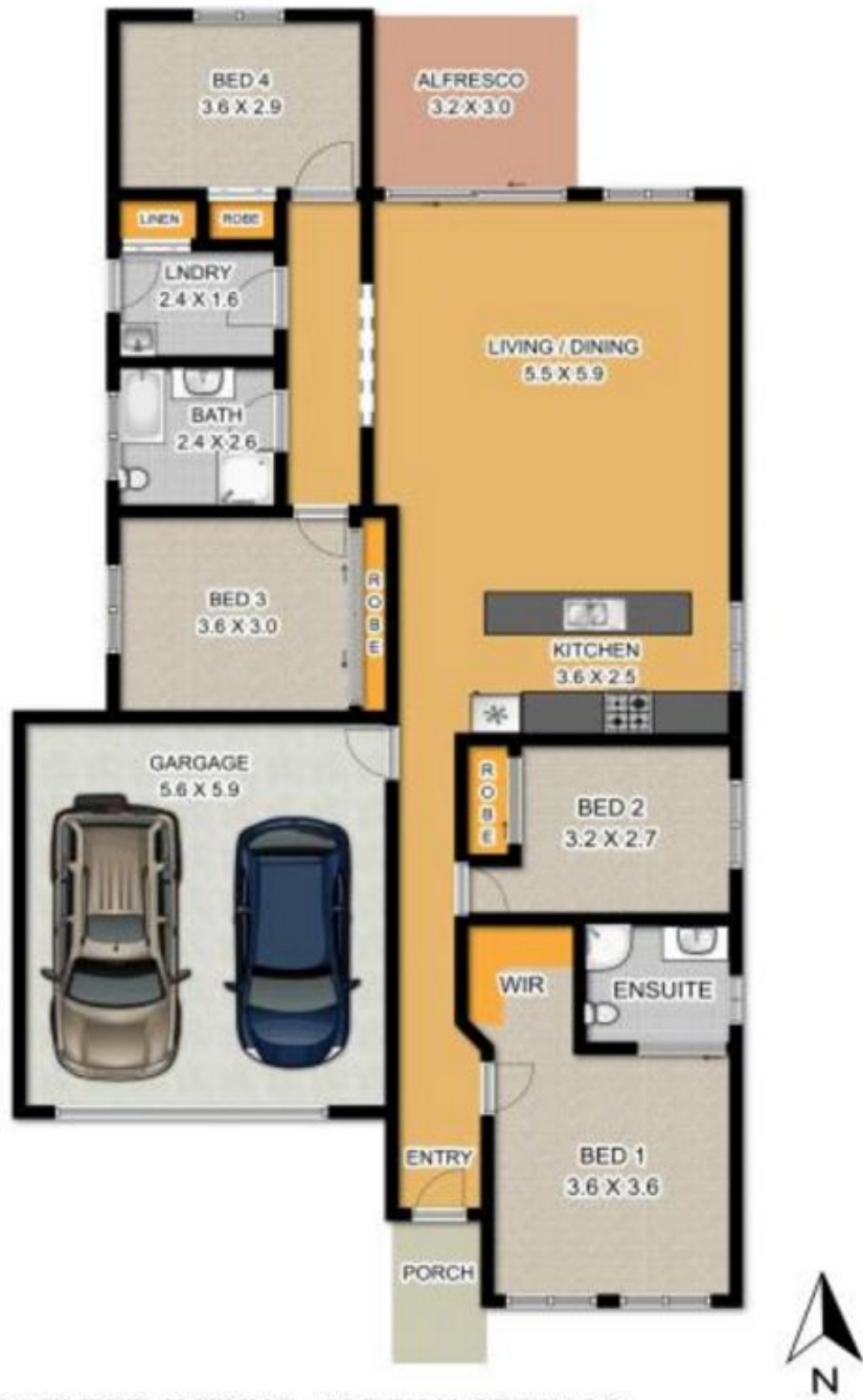
23 FLEET AVENUE, JORDAN SPRINGS