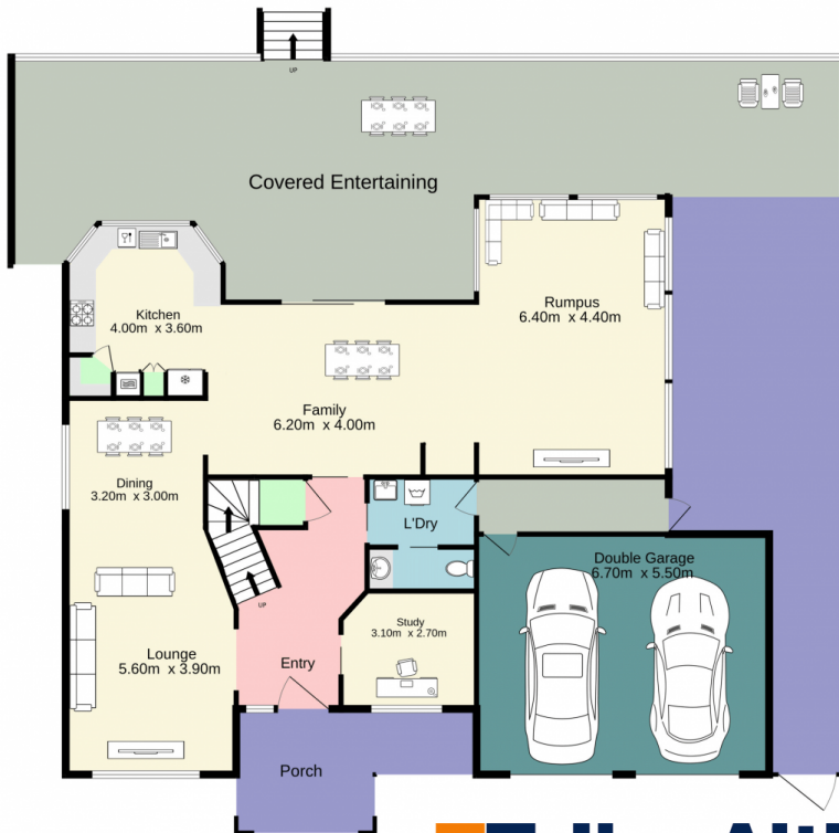
Ground floor 250.9 sq.m. approx.