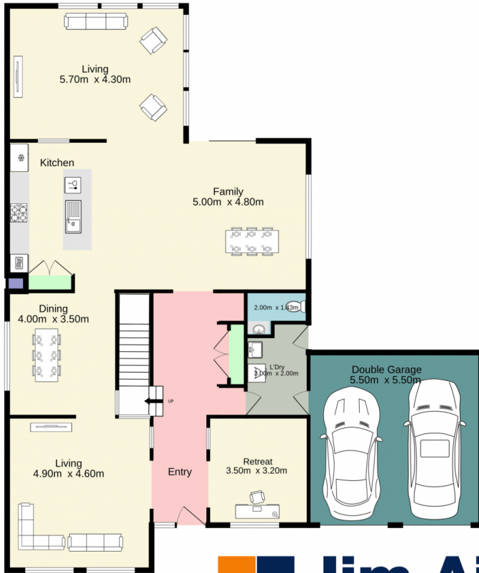
Ground floor 178.7 sq.m. approx.