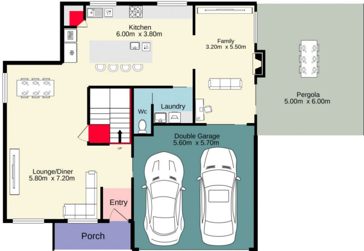
Ground floor 142.8 sq.m. approx.