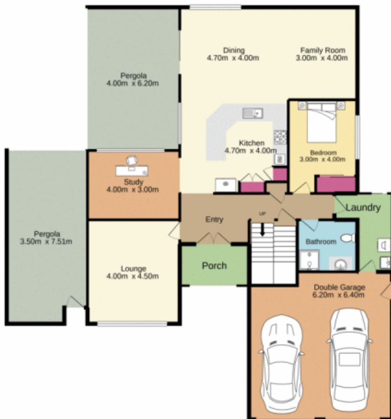
Ground floor 203.5 sq.m. approx.