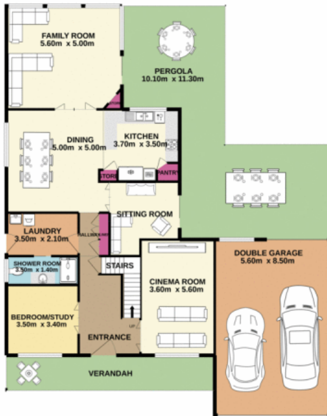
GROUND FLOOR 185.1 sq.m. approx.