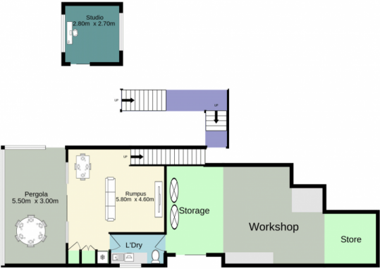
Ground floor 89.1 sq.m. approx.