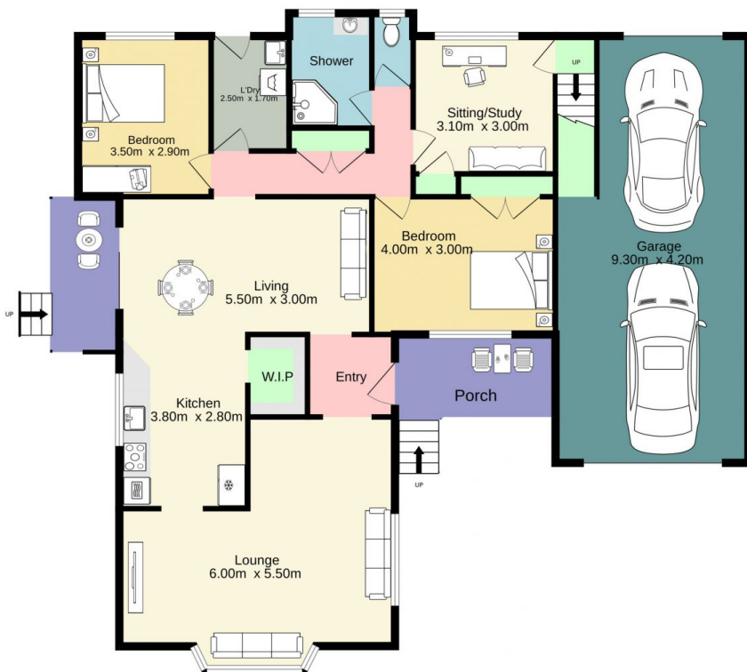
Ground floor 147.3 sq.m. approx.