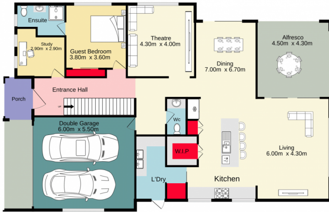
Ground floor 208.9 sq.m. approx.