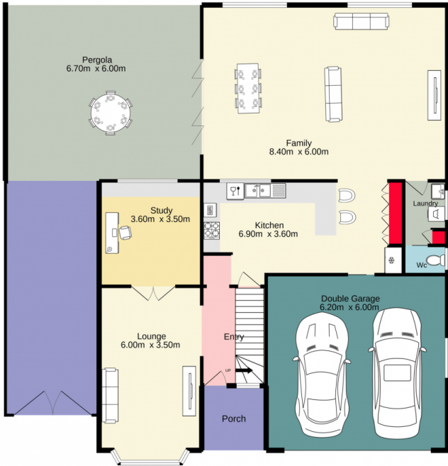
Ground floor 196.1 sq.m. approx.