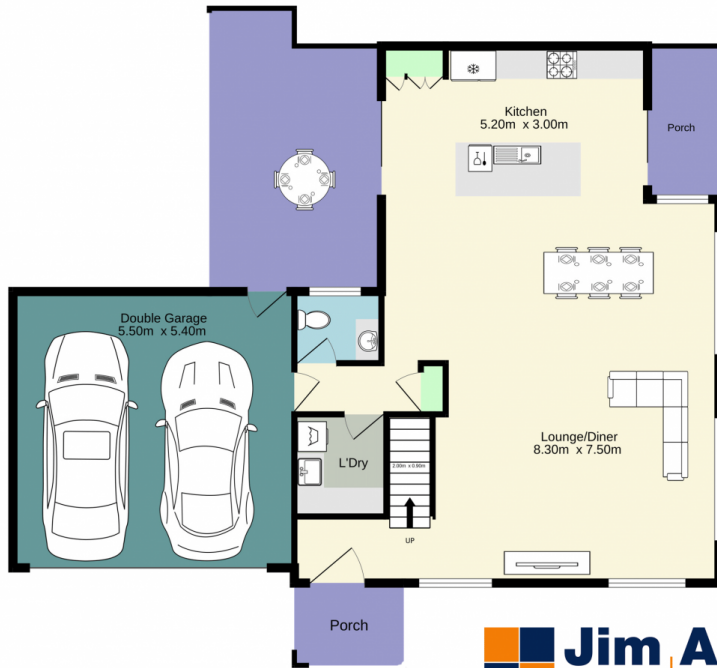
Ground floor 104.4 sq.m. approx.