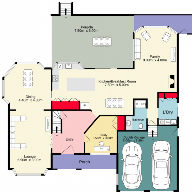
Ground floor 200.2 sq.m. approx.