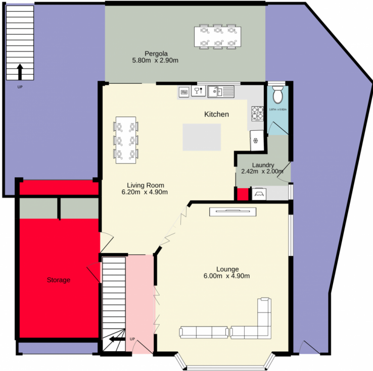
Ground floor 103.5 sq.m. approx.