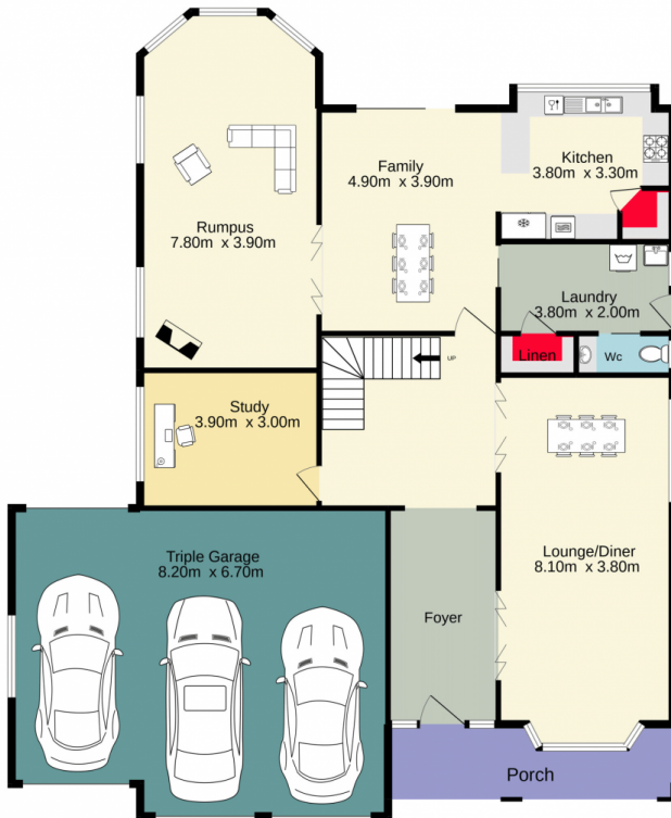
Ground floor 192.3 sq.m. approx.