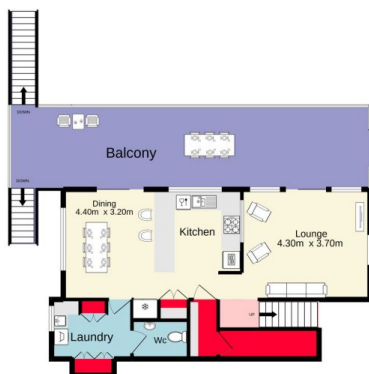
Ground floor 56.8 sq.m. approx.