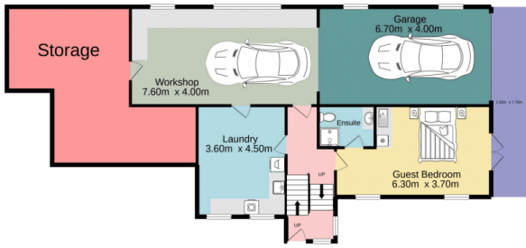
Ground floor 141.7 sq.m. approx.