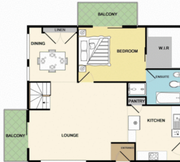
Jim Aitken Partners ENTRANCE FLOOR

Whilst every attempt has been made to ensure the accuracy of the floor plan contained here, measurements of doors, windows, rooms and any other items are approximate and no responsibility is taken for any error, omission, or mis-statement. This plan is for illustrative purposes only and should be used as such by any prospective purchaser. The services, systems and appliances shown have not been tested and no guarantee as to their operability or efficiency can be given. Made with Metropix ©2018