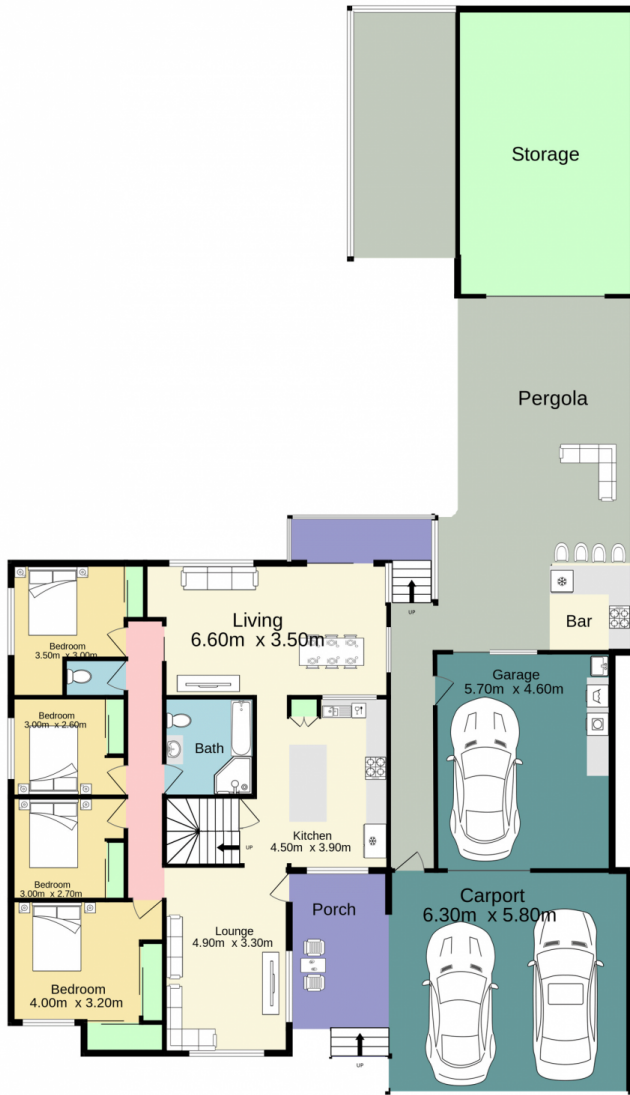
Ground floor 281.1 sq.m. approx.