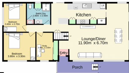
Ground floor 146.0 sq.m. approx.