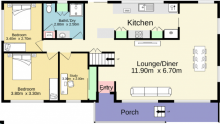
Ground floor 146.0 sq.m. approx.