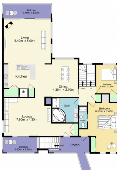
Entrance floor 139.2 sq.m. approx.