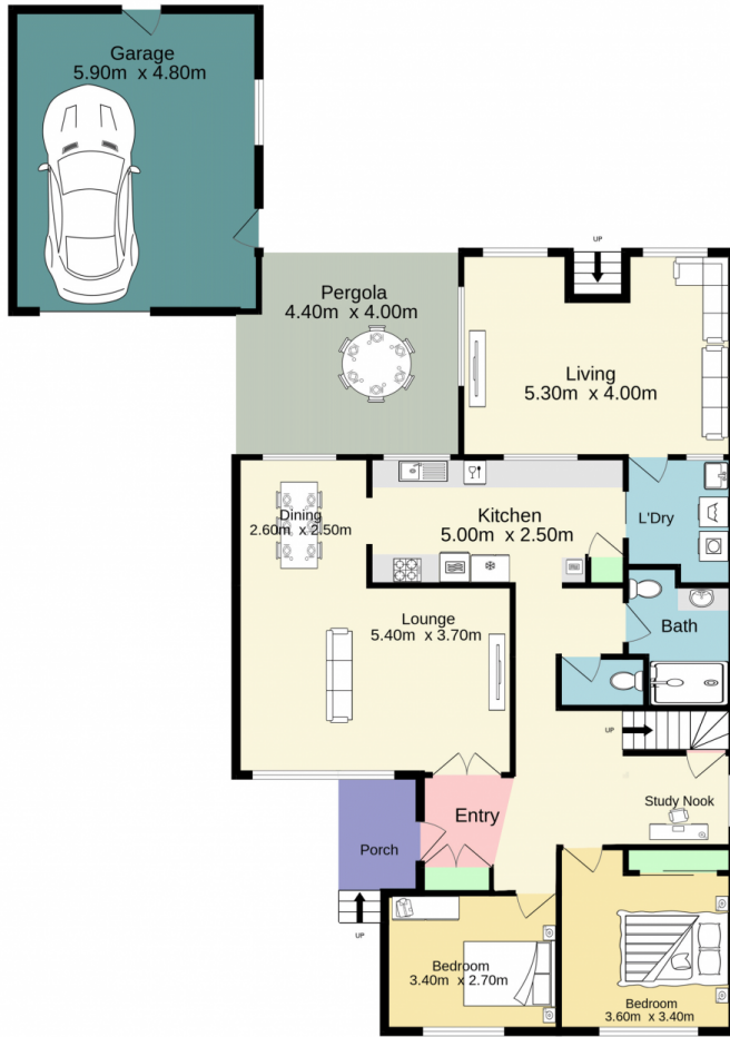
Ground floor 158.1 sq.m. approx.