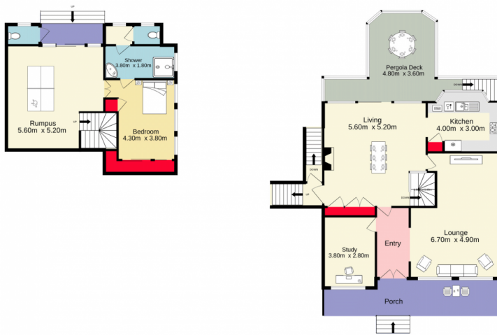
Entrance floor 121.1 sq.m. approx.