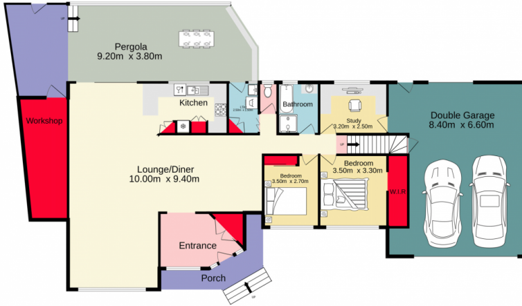
1st floor 59.7 sq.m. approx.