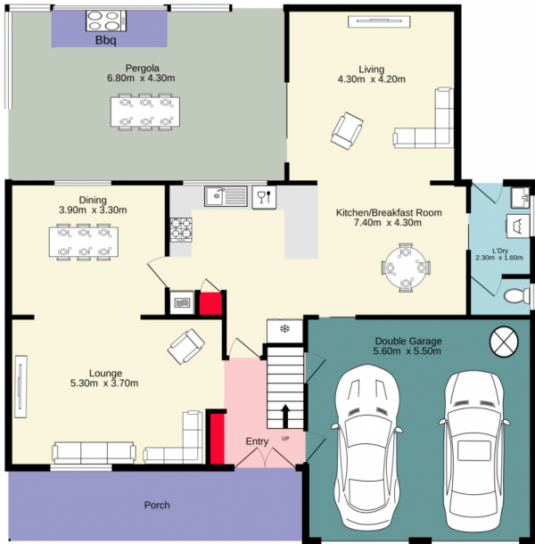
1st floor 88.2 sq.m. approx.