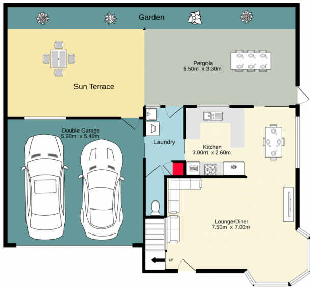
Ground floor 135.5 sq.m. approx.