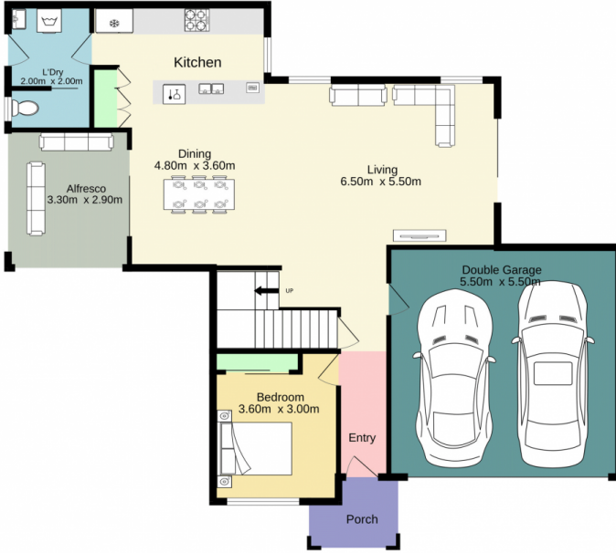
1st floor 82.6 sq.m. approx.