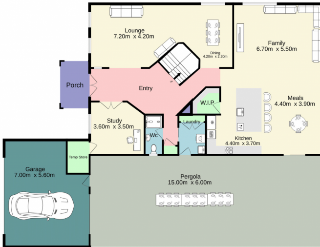
Ground floor 280.6 sq.m. approx.