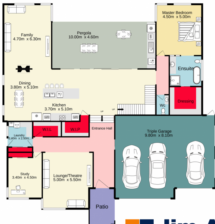
Ground floor 353.2 sq.m. approx.