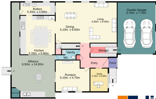
Ground floor 250.1 sq.m. approx.