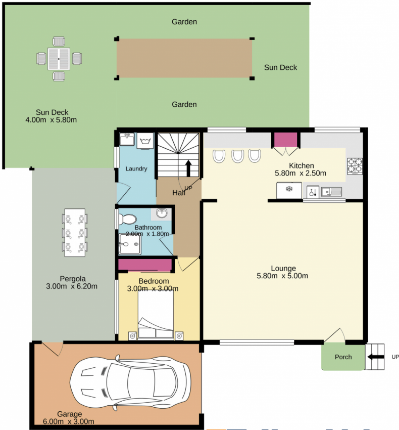
Ground floor 109.1 sq.m. approx.