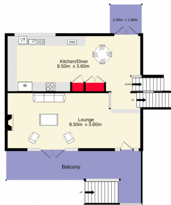
Entrance floor 64.0 sq.m. approx.