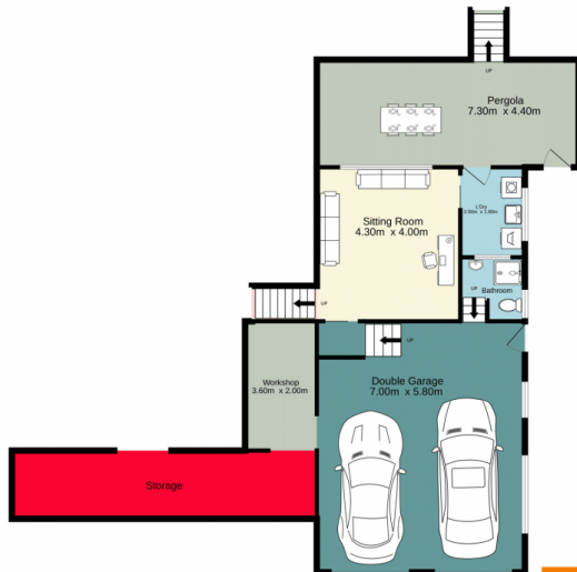
Ground floor 113.9 sq.m. approx.