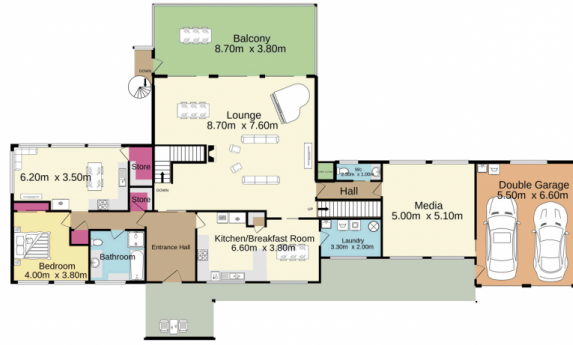
Ground floor 266.8 sq.m. approx.