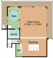
Basement 110.8 sq.m. approx.