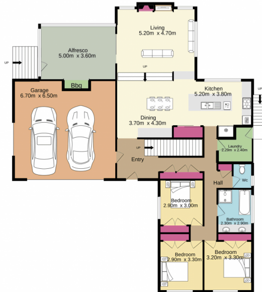
1st floor 62.5 sq.m. approx.