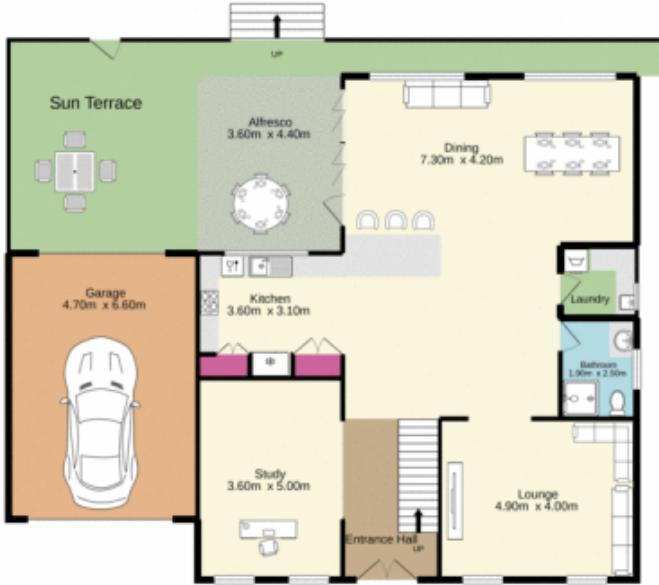
Ground floor 163.9 sq.m. approx.