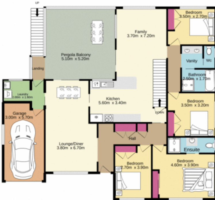
Ground floor 178.5 sq.m. approx.