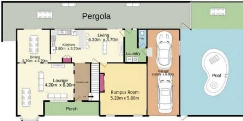
1st floor 70.8 sq.m. approx.