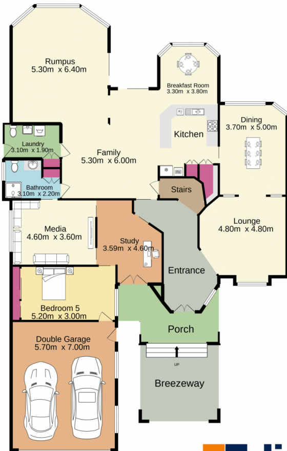
Ground floor 252.7 sq.m. approx.