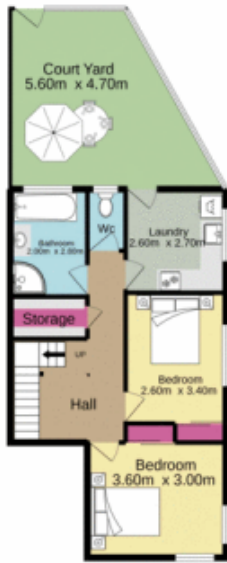
Ground floor 47.8 sq.m. approx.