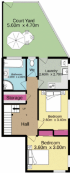
Ground floor 47.8 sq.m. approx.