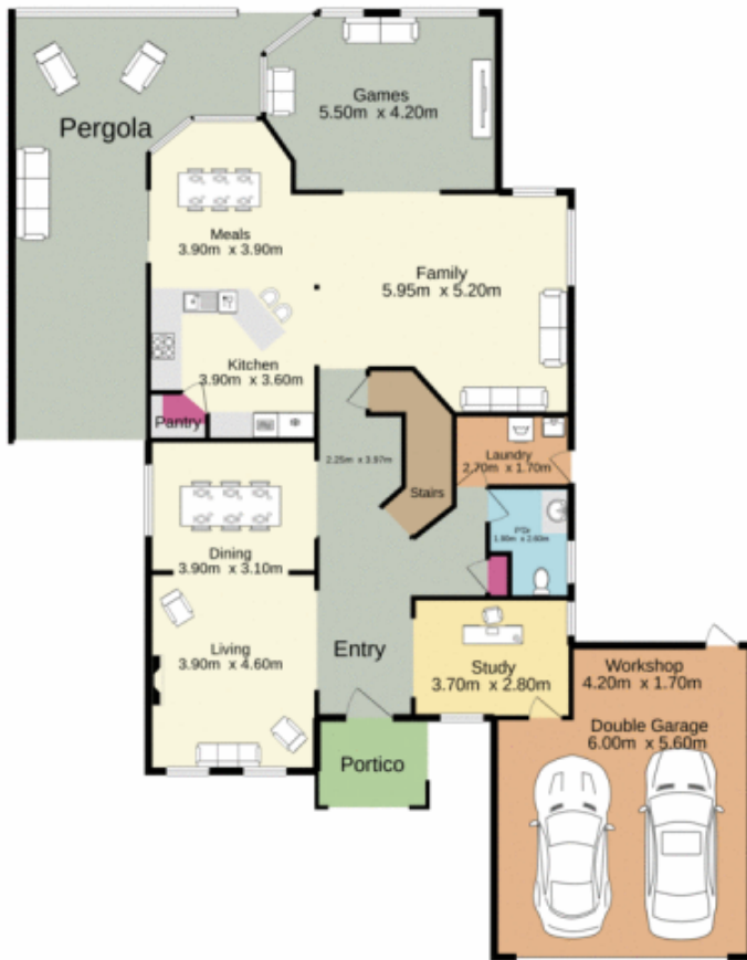
1st floor 130.8 sq.m. approx.