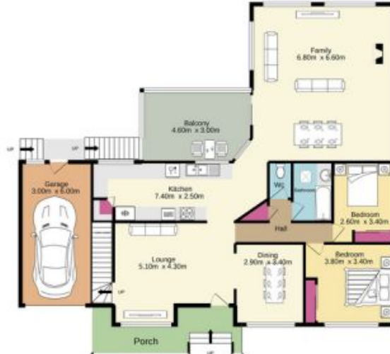
Ground floor 254.7 sq.m. approx.