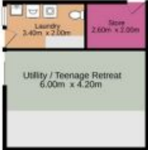
Basement 37.2 sq.m. approx.