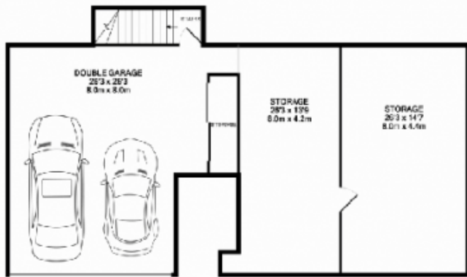
GROUND FLOOR APPROX FLOOR AREA 1851 SQ. FT. (106.6 SQ. M.)