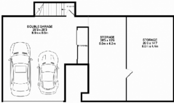
GROUND FLOOR APPROX FLOOR AREA 185 SQ.FT. (16.8 SQ.M.)