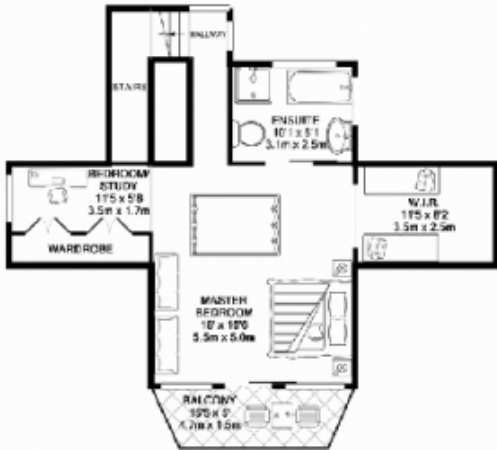
FIRST FLOOR APPROX FLOOR AREA 211 SQ.FT. (19.5 SQ.M.)

TOTAL APPROX. FLOOR AREA 396 SQ.FT. (36.3 SQ.M.)